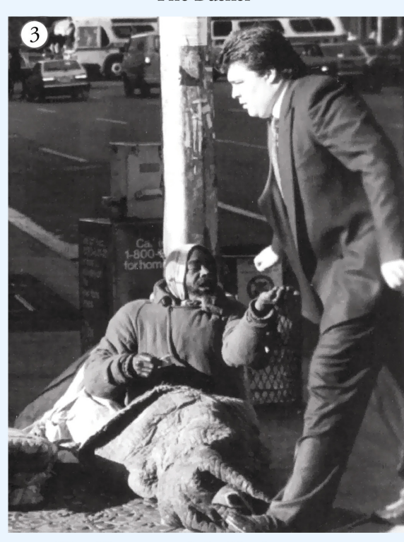
The Beggar and the Businessman