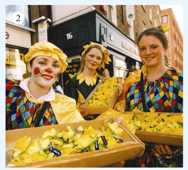
The Charity Collectors – Daffodil Day