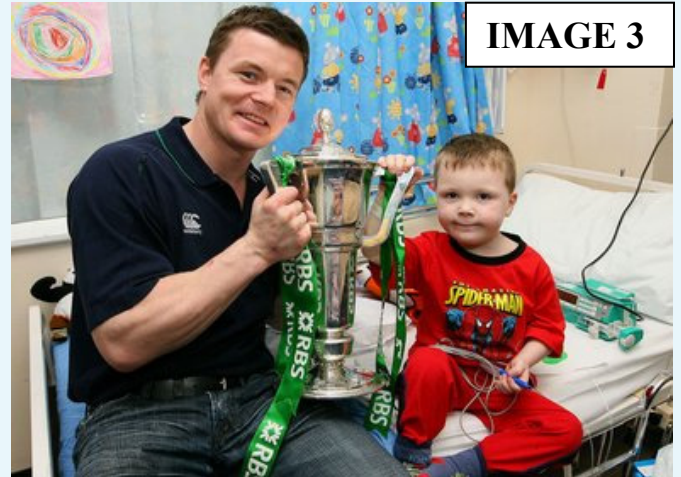
O'Driscoll visits a children's hospital.

N.B. Candidates may NOT answer Question A and Question B on the same text.