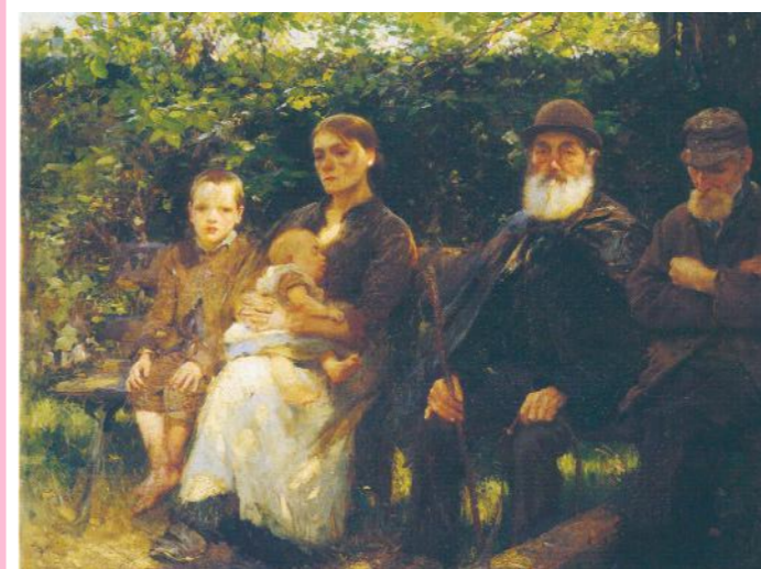
I bPáirc i mBaile Átha Cliath, Solas agus Scáth le Walter Osborne In a Dublin Park, Light and Shade by Walter Osborne