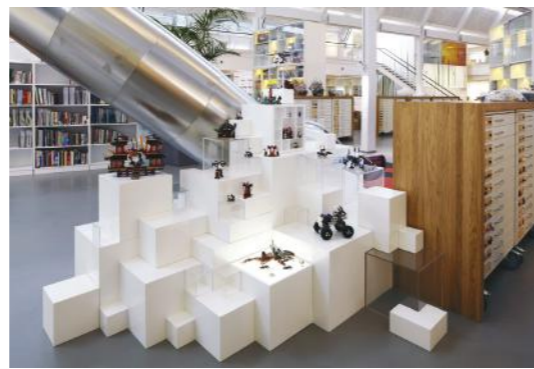
Oifig Lego, an Danmhairg Lego Office, Denmark