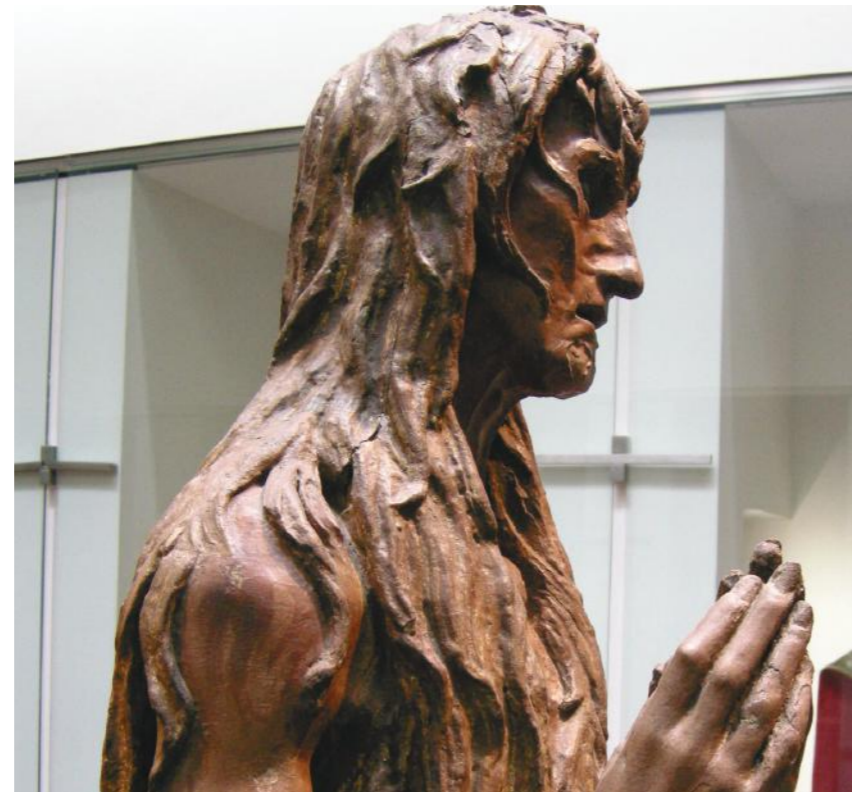
Máire Mhaigdiléana le Donatello Mary Magdalene by Donatello