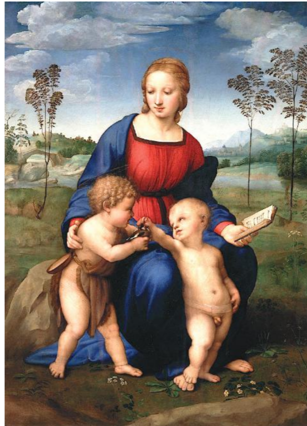
Maighdean na Lasrach Coille le Raphael Madonna of the Goldfinch by Raphael