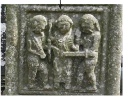
Ardchros Mhaoine Cross of Moone