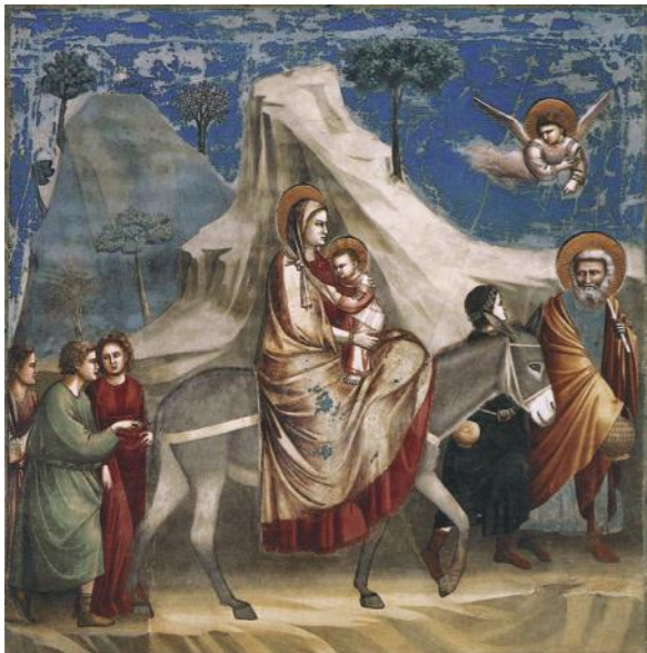
An Teitheadh chun na hÉigipte le Giotto The Flight into Egypt by Giotto