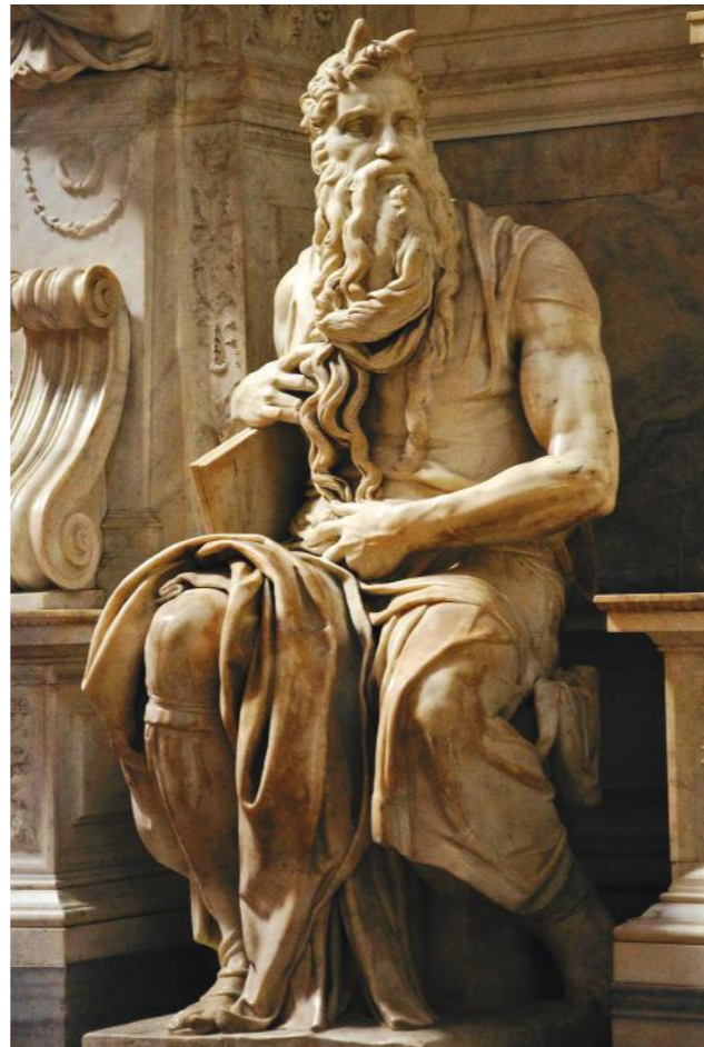
Maois le Michelangelo Moses by Michelangelo