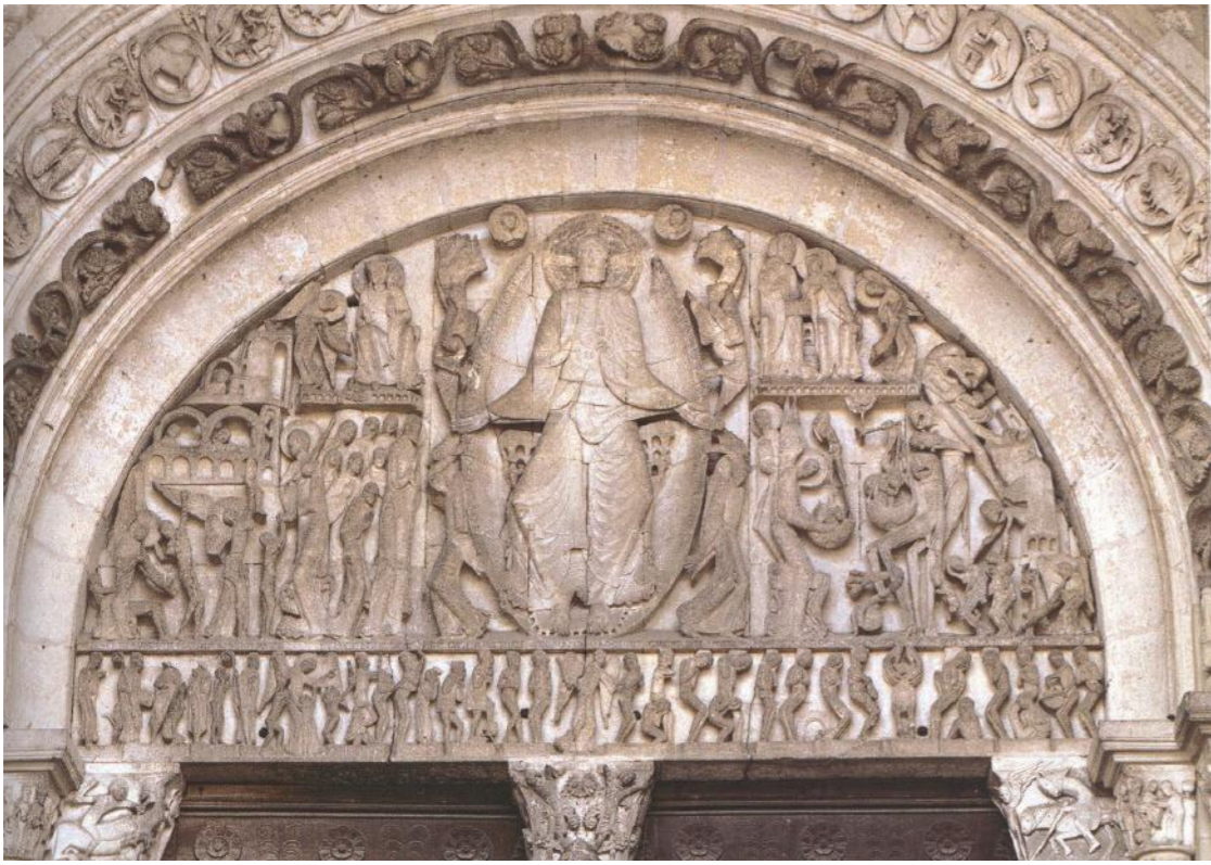
An Breithiúnas Deireanach le Gislebertus Last Judgement by Gislebertus