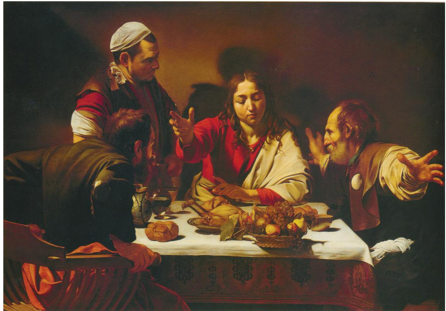
An Suipeár in Eamáús le Caravaggio Supper at Emmaus by Caravaggio